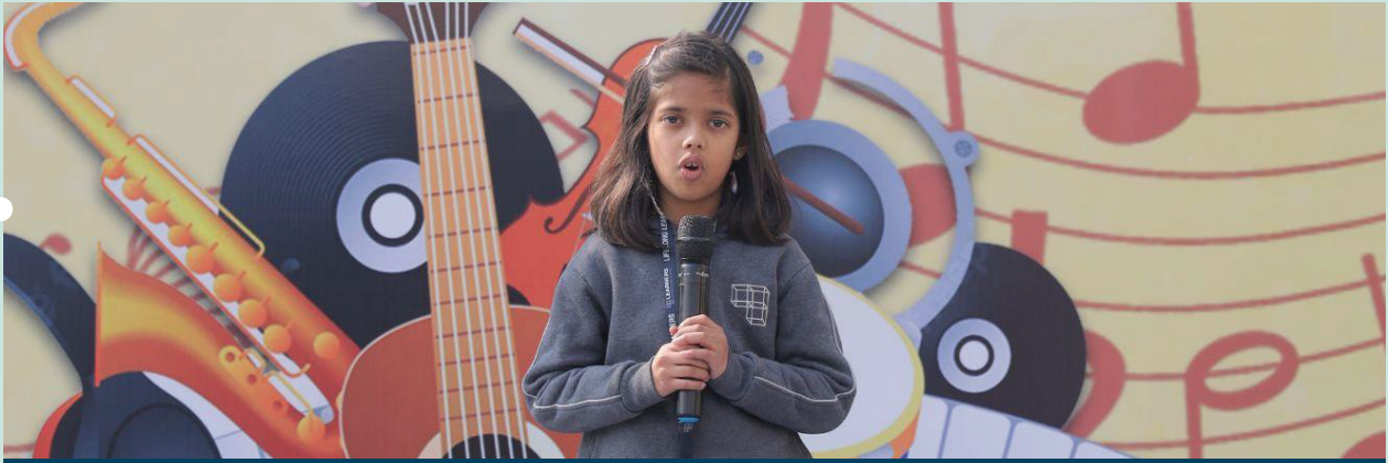
Our Grade II learner doing the compering.