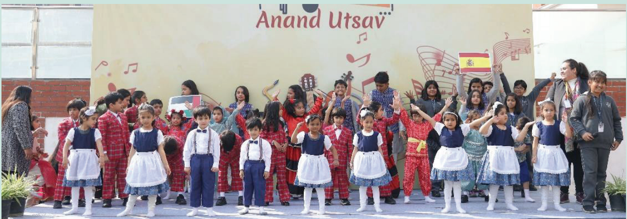
Early years Learners participated in various events on the occasion of Anand Utsav.

The art of dance plays an important role, not only in India, but it is also a symbol of traditional culture in various other countries. Our primary year learners explored dance forms from different countries and presented some astonishing dance forms of India, China, U.A.E, Spain. This was a great learning for our learners as with being knowledgeable about different dance forms, they also had an enriching experience of performing in front of a mass audience. Our learners have shown tremendous confidence and have amazed everyone with their mesmerizing and heart winning dance moves in 'Anand Utsav.'