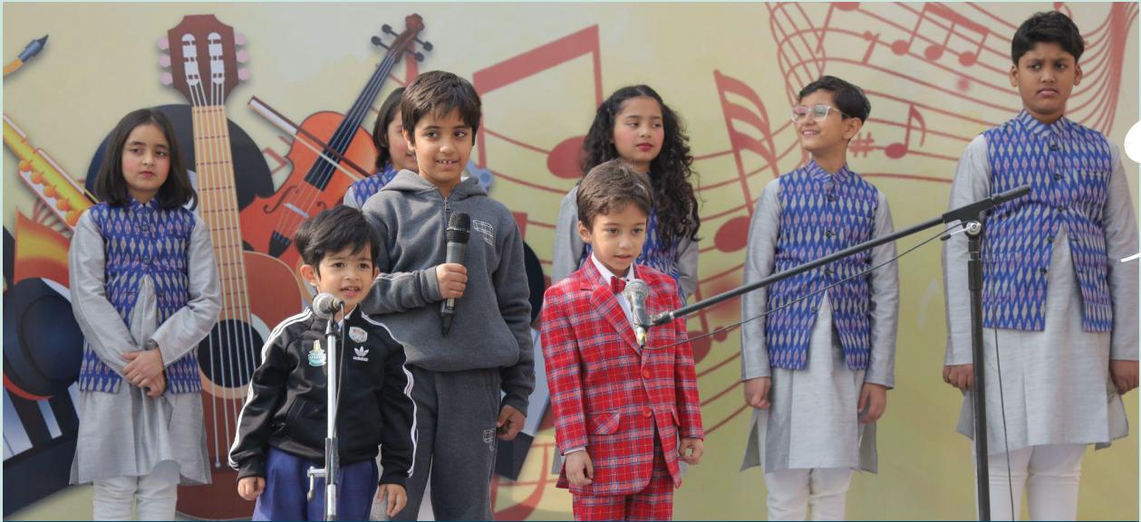
Our early years learners surprised everyone with their perfect performances.