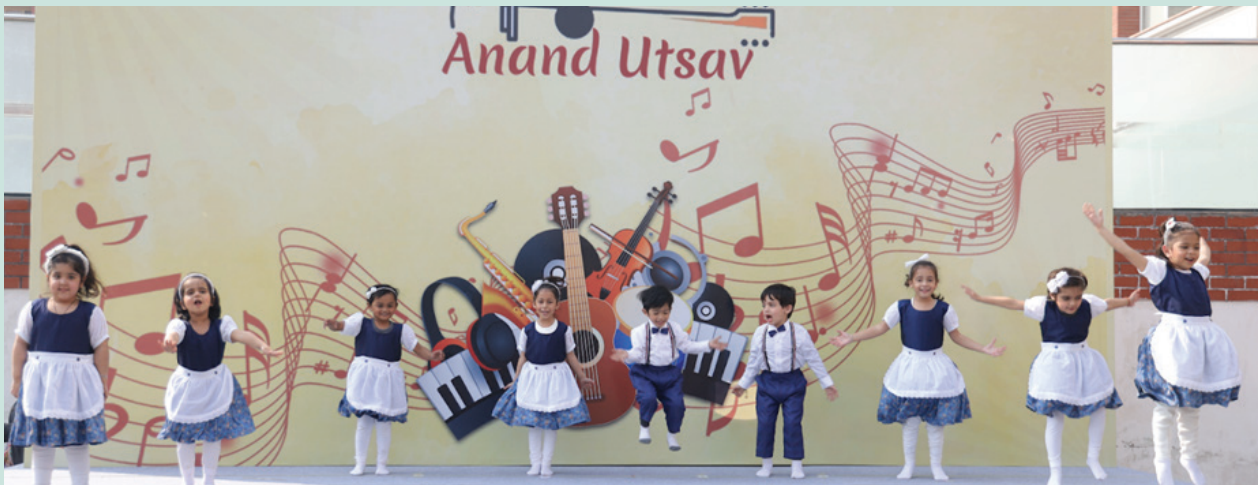
Early years performance on Anand Utsav.