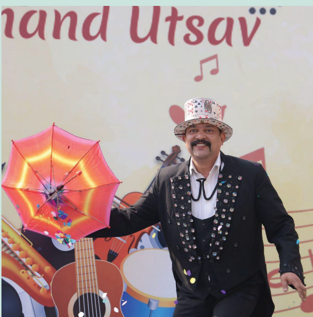
The Magic Show was enjoyed by all.