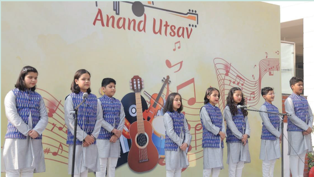
Learners present a song on Anand Utsav.