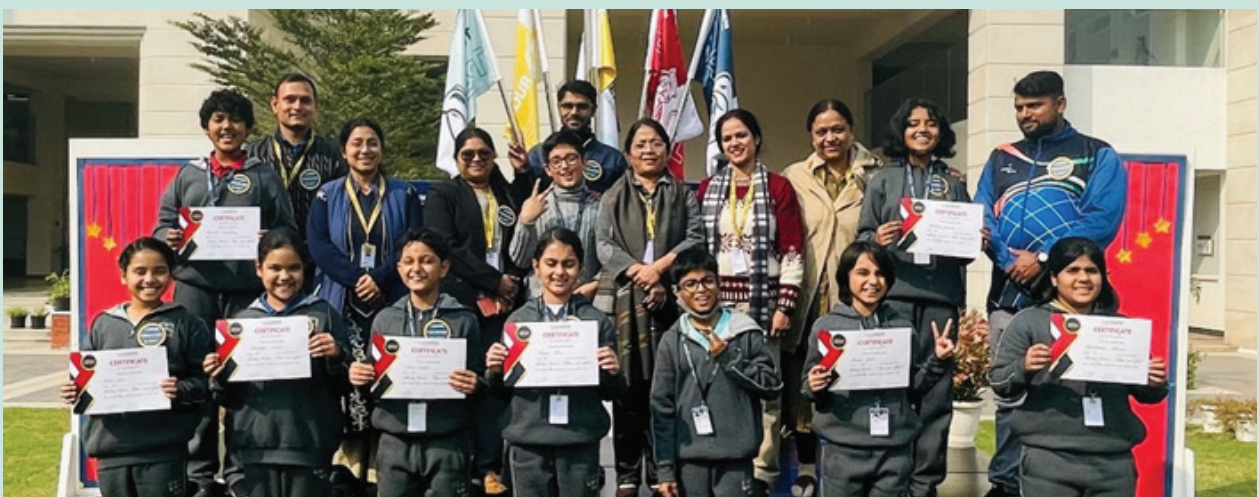
Learners receiving certificates after the skating event.