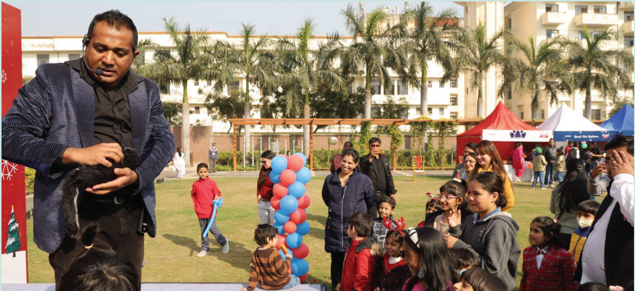
Learners enjoying the puppet show.