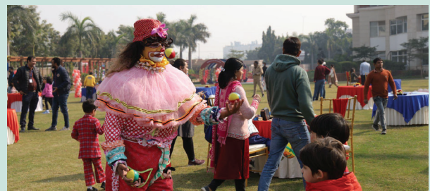
Learners thoroughly engage with the clown and indulge in some juggling.