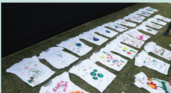
Wonderful artwork by our learners.