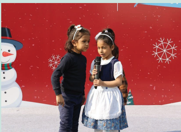
Learners participate in the singing competition.