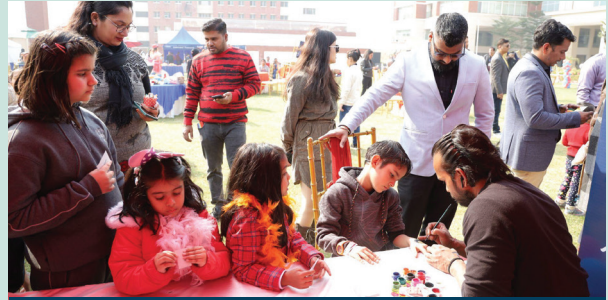
Learners getting the tattoos done of their favourite characters.