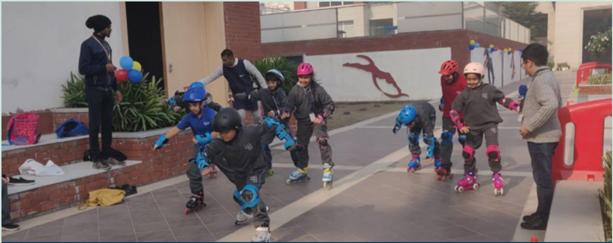
Learners of Grade IV are off to a start!