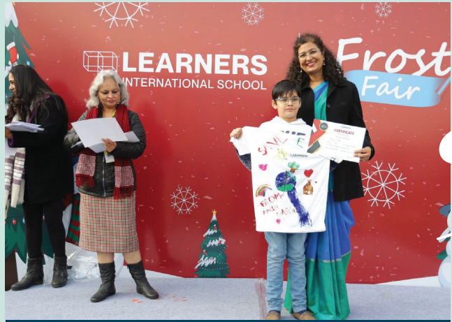
Learners receiving certificates in the painting competition.