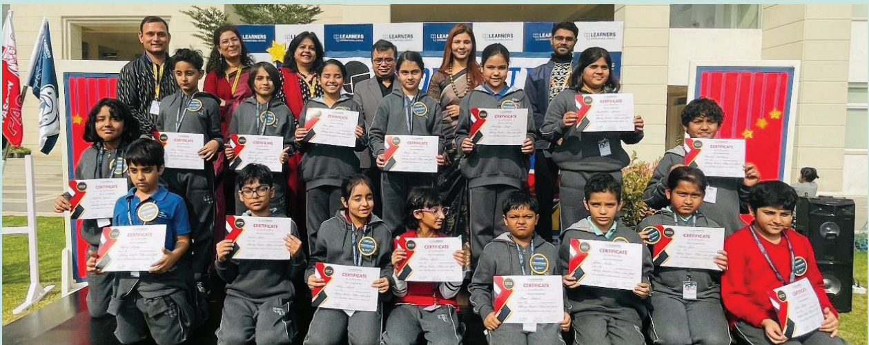
Our participants receive their certificates