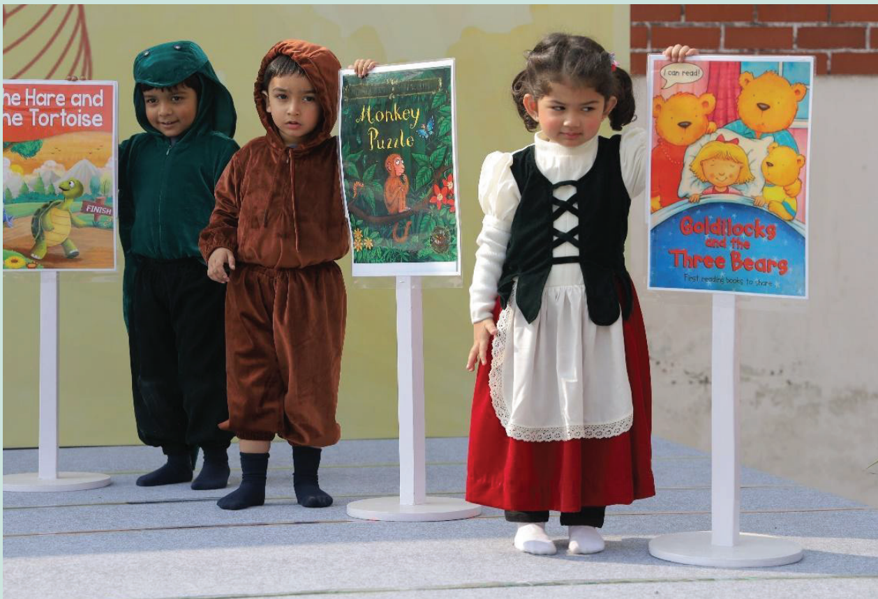
Our learners perform on Anand Utsav.

It was a proud moment for the facilitators and parents to see them being independent and carrying themselves on stage. The event saw a beautiful display of 'Caring' and 'Principled' attributes of the IB Learner Profile as the learners from Grade I-V supported the event and took care of the learners. We look forward to witnessing more such opportunities of growth and learning for our learners.