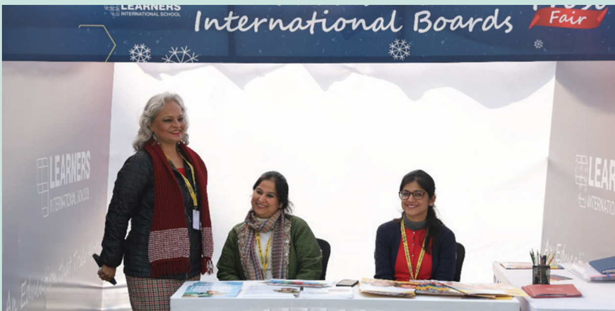
Facilitators help parents understand the requirements of the international curriculum.

Our All About International Boards stall helped parents understand the curriculum we follow at Learners International School. For learners, Cambridge IGCSE helps improve performance by developing skills in creative thinking, inquiry and problem solving. It is the perfect springboard to advanced study. Through our International Curriculum stall we helped parents understand the need and how it is different from other curriculums.