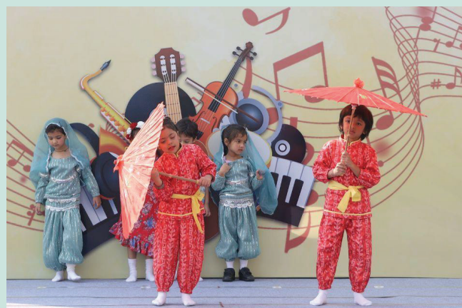
Dance performances by our early years.

Learners explored the diversity of music by knowing about different musical styles in local to global context and discovered different flavors of music. They got to know about different layers of musical compositions based on a certain musical style including musical instruments, vocal style, diction. They learnt songs based on classical and western musical style and performed the same in the school event “Anand Utsav”.