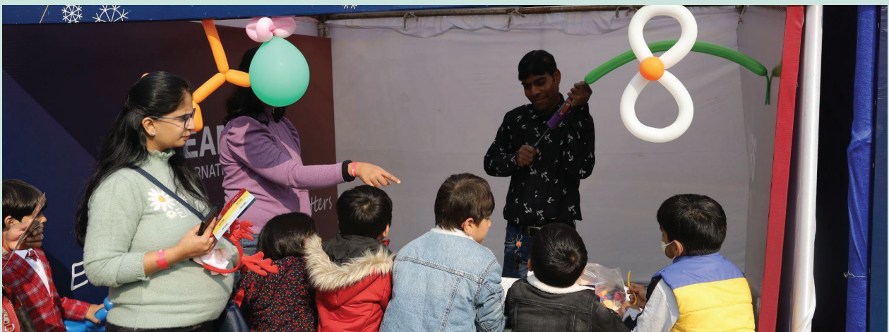
Not only the learners, even the parents got excited about creating shapes using balloons.