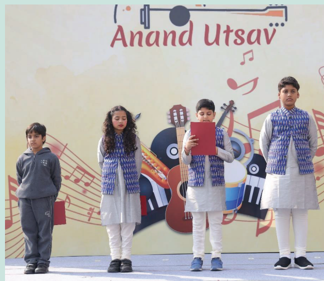
Learners of grade 5 and 3 taking the lead and compering the event.