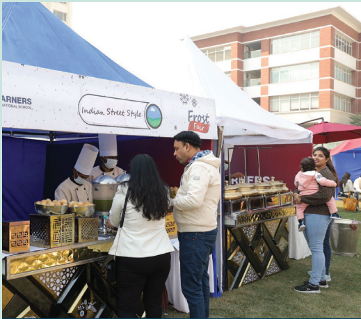
The scrumptious food - enjoyed by everyone.