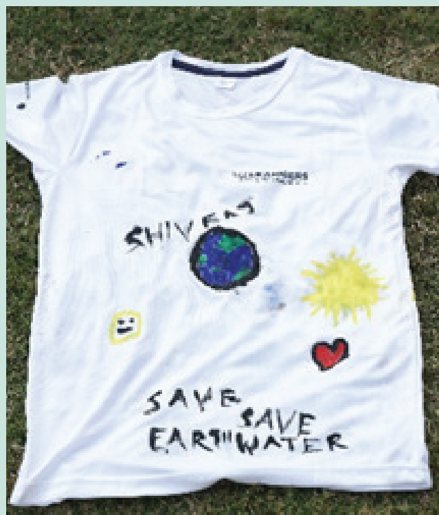
Learners showcasing their creativity.