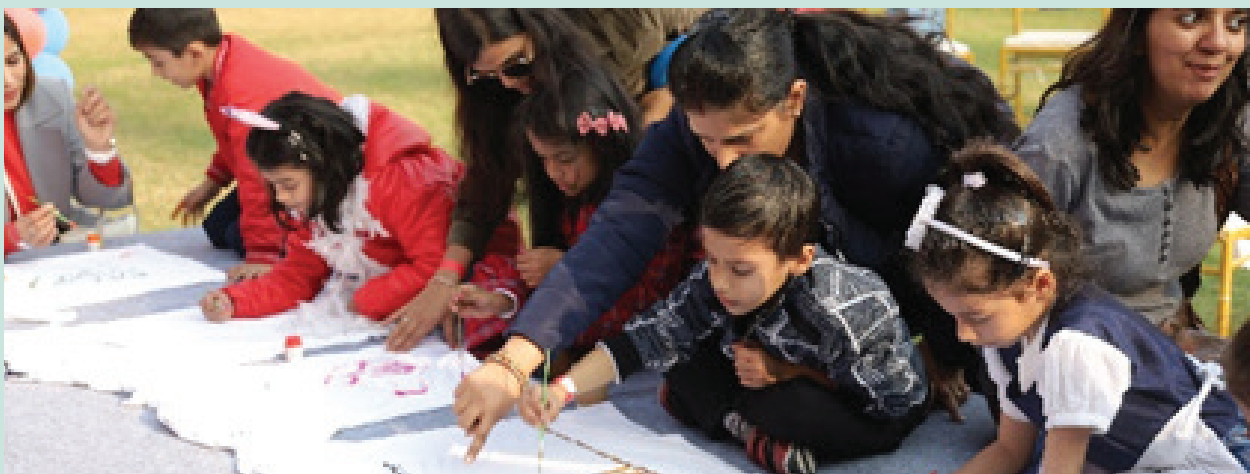
Learners showcasing their creativity.

Life is all about using the whole box of crayons. The painting competition gave our learners the perfect opportunity to showcase their skills. They explored the horizon of creativity and experience, the fun and pride by colouring a T-shirt. Learners also participated energetically in the singing competition. It also helped our learners expand their minds and increase their self-confidence.