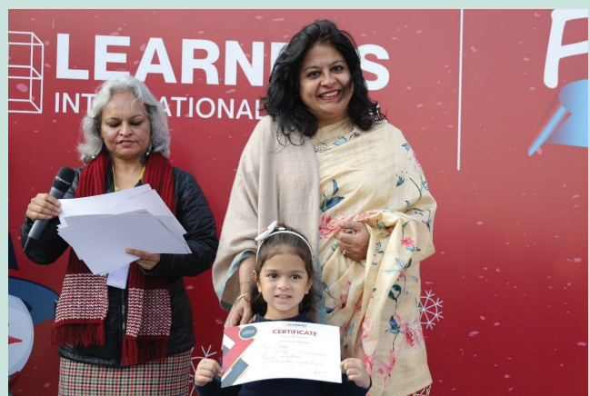
Learners receiving certificates for the singing competition.