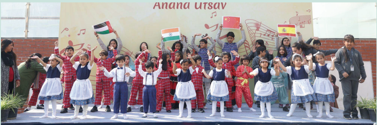
A proud moment for all the learners and facilitators.