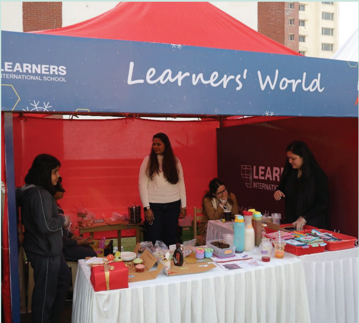
Learners of grade V setting up their stall.