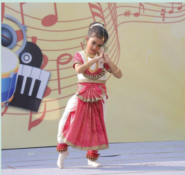
Grade 1 Learner performing dance on Anand Utsav.