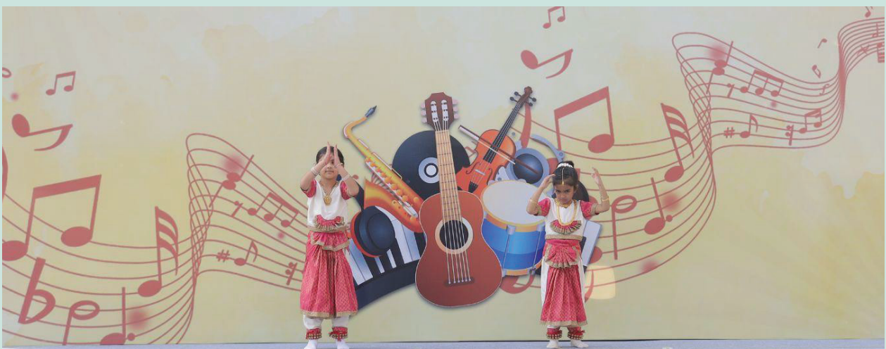
Grade 1 learners showcasing the traditional dance forms.