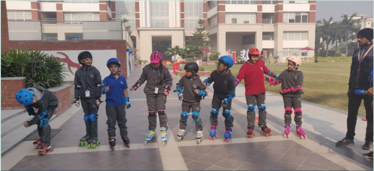
Learners of Grade 3 all set to participate in the skating event.