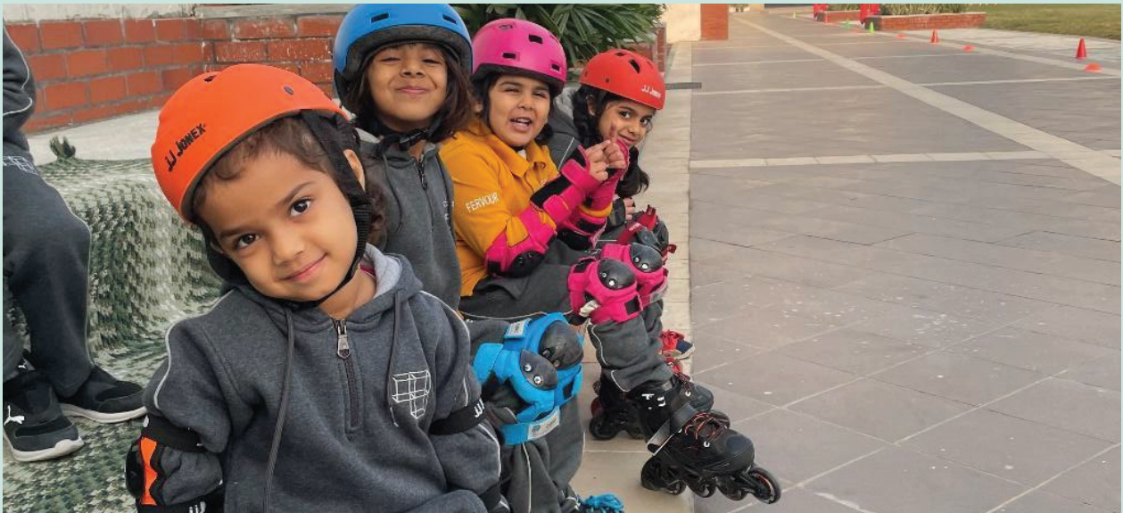
Our Kindergarten learners participated in the skating event with passion and vigour.

We hosted our Skating event- "Flow and Glide" , on 2nd December 2022 . The main aim of the event was to introduce our young athletes to a multisport lifestyle. It gave our learners an opportunity to showcase their skating skills. Skating is a great way to alleviate back-to-school stress, and it provides a welcome distraction from everyday worries. Our learners enthusiastically participated in the event and showcased their true spirit of sportsmanship. They displayed great body balance and glided smoothly on wheels. All our learners participated with a lot of enthusiasm in the skating event held at school. Even the ones who were in very nascent stages of skating put in their very best and showed true sportsman spirit by completing the rounds.