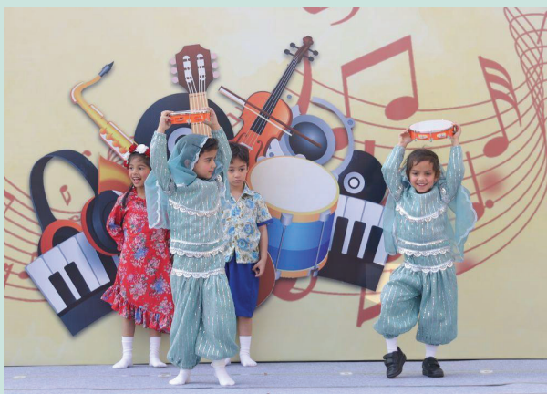
Dance performances by our early years.